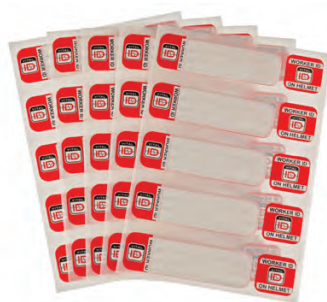
Pack contains 5 sheets