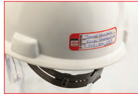
Two-part label set